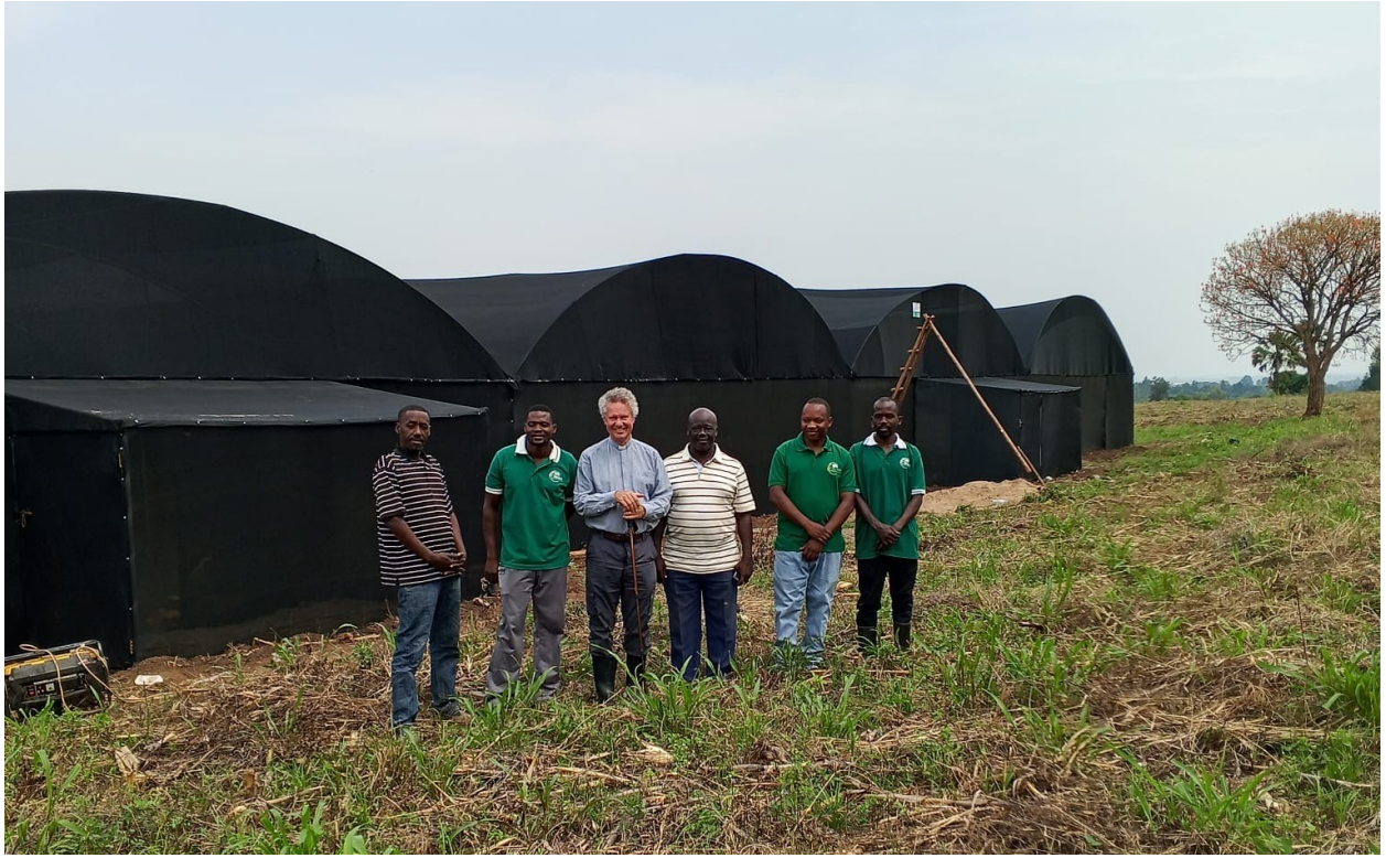
The completed greenhouse with the team