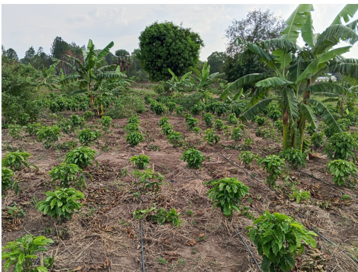
Coffee nursery garden showing well mulched young plants

We pray for you a blessed Holy Week and a Joyful Easter tide.