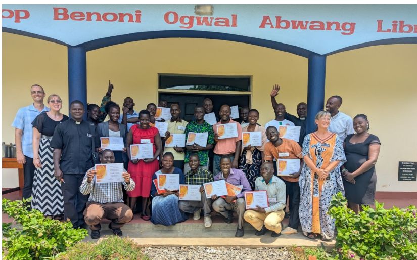
Students and staff at the end of the Kairos mission training