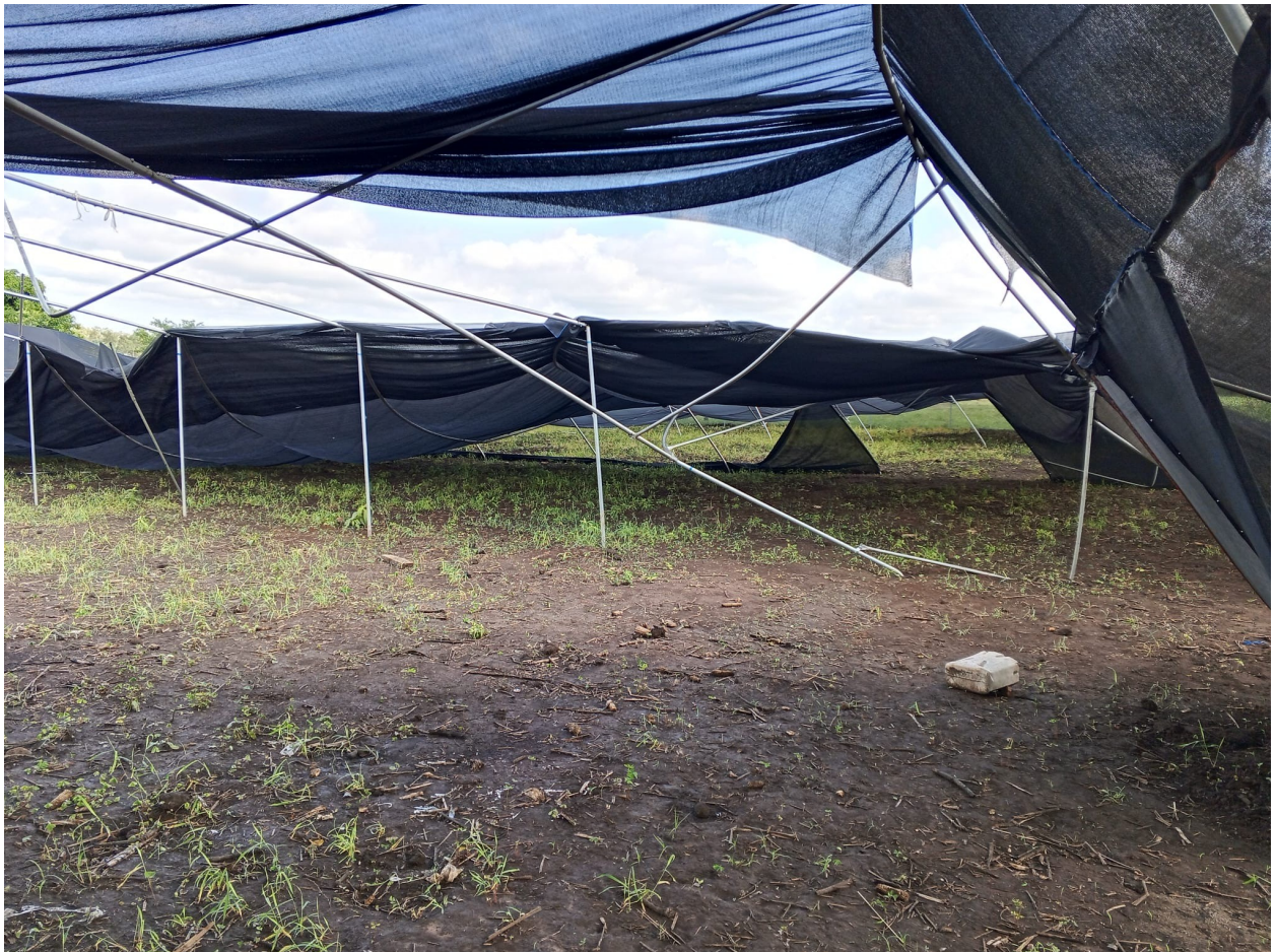
The greenhouse after a strong wind