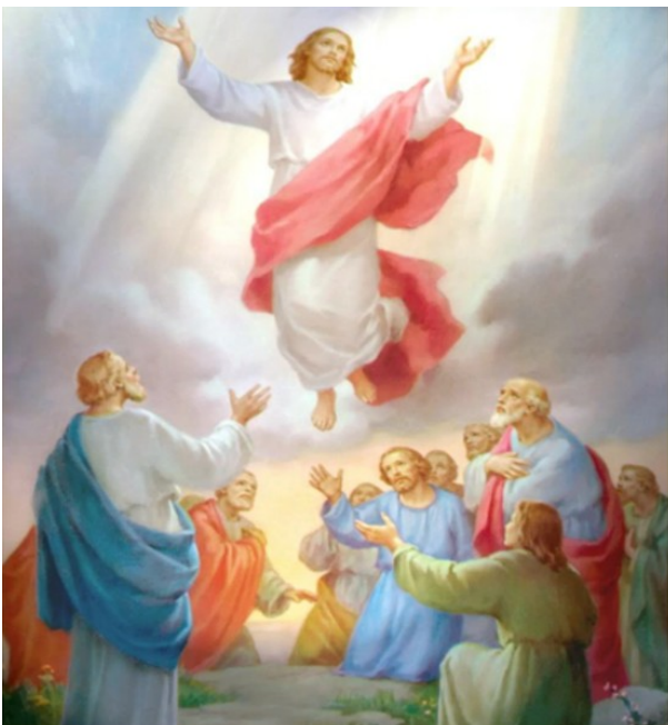
While they beheld, he was taken up; and a cloud received him out of their sight. (Acts 1.9)

A special person who supports and inspires, they are fun and loving just like normal parents, but much cooler.