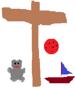
Christ Church and St. Peter's Mountsorrel