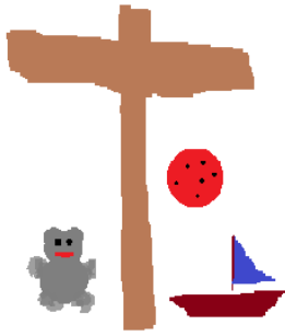
Christ Church and St. Peter's Mountsorrel